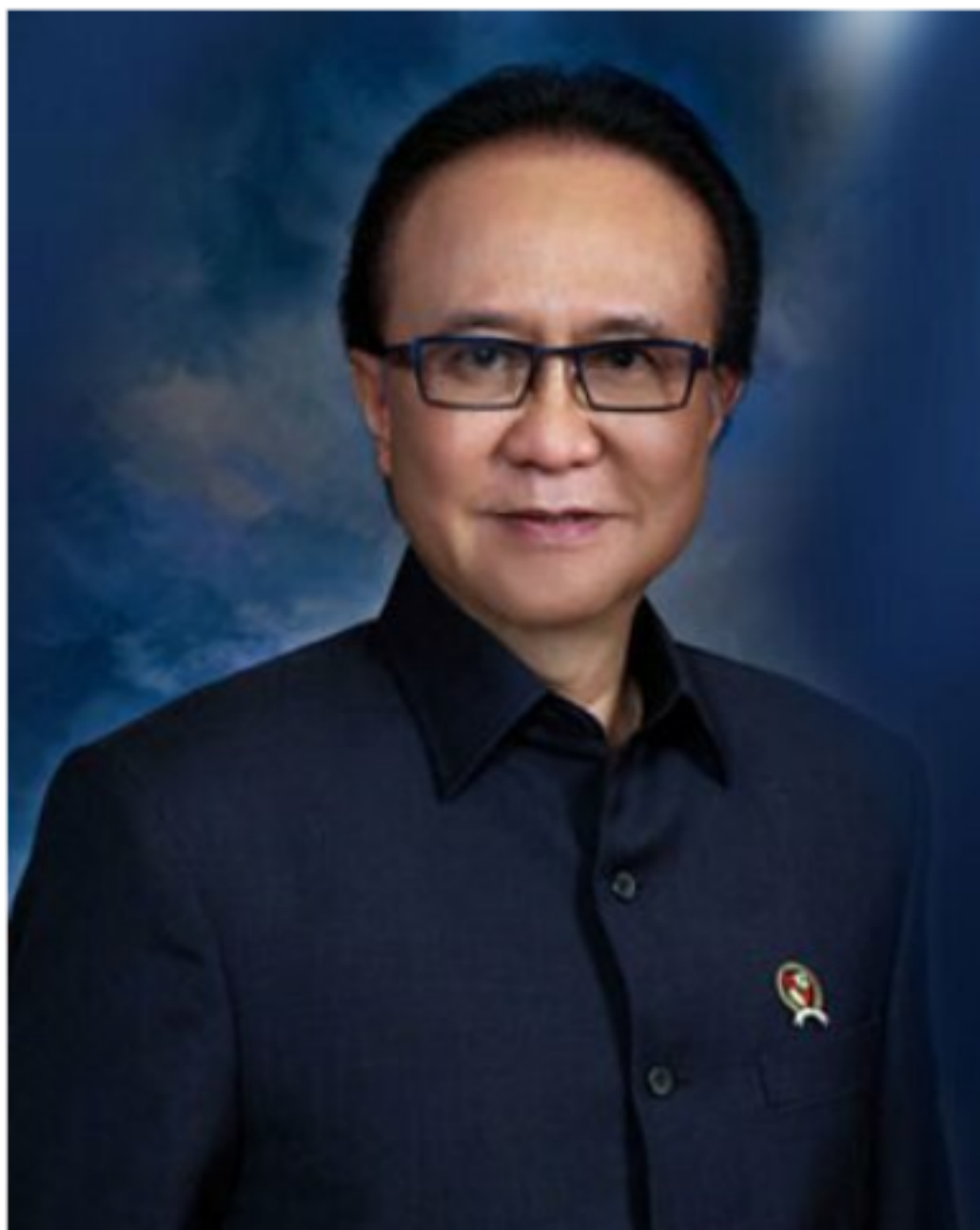
Sharif Cicip Sutardjo 博士

中霆世纪公司总裁于2023年6月30日与新上任的 PT.PEB 董事长及PT.Bumi 的总裁, Sharif Cicip Sutardjo 博士,通过视频电话进行会议讨论;就加快印尼PANDOPO地区的褐煤原料加工基地的投资合作进行了定期商洽。Sharif Cicip Sutardjo 博士曾任印尼海洋和渔业部部长(第六任部长),民进戈隆甘卡里亚党的现任副主席。